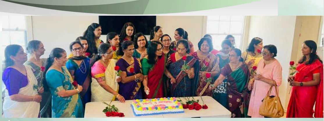
Sunday School celebrated Mother's Day